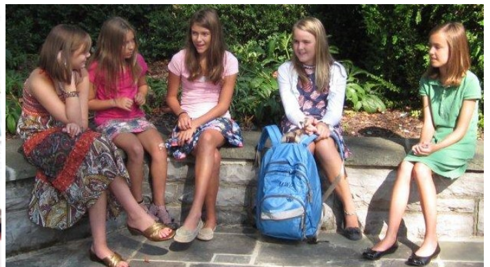
Moments in the Life of Our Parish