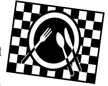
Table Fellowship consists of groups who gather monthly for dinner. The groups usually meet in homes, but sometimes they go to a restaurant, have a picnic, have brunch, or just meet for dessert. It's very flexible and groups can choose to do whatever meets the needs of the participants. Groups consist of couples and singles and even some who don't normally attend church.

Friday, Sept. 24, we will kick off the year with a group potluck supper at the church. We will have wine/soft drinks and cheese at 6, with dinner at 6:30. If you've participated in a group in the past, we hope you'll do so again, and we'll automatically put you in a group, unless you request not to be included. If you were not part of a group this past year, please consider joining. Participants say, "It's a great way to get to know people on a deeper level than just greeting them at church." And, "The group was very interesting, and we enjoyed being part of it; each time our group met, we enjoyed the evening more and more."