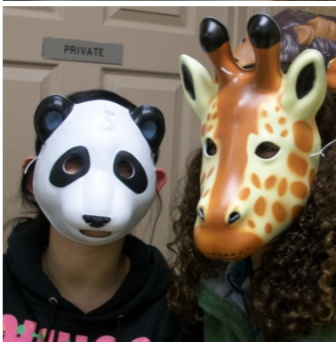
WALKIN' ON THE WILD SIDE —The youth of our parish spent a recent Sunday afternoon with the residents of Safari Park in Natural Bridge.